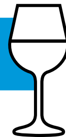
100mL serve of wine

Each of these represents one standard drink