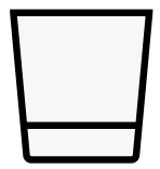
30mL spirit nip